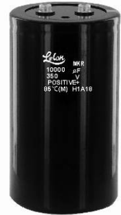
Sleeve & Marking Color: Black & Golden